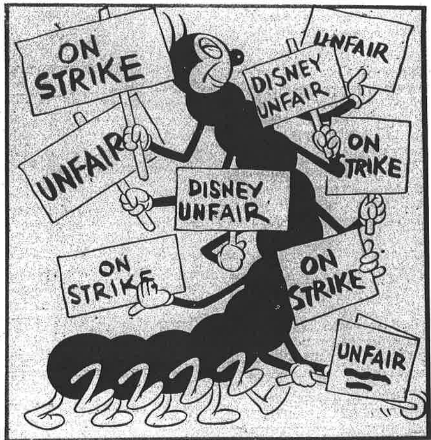
Picket sign from a protest in 1941 during a time of heightened labor unrest, when Walt Disney fired union organizers on his art staff.

□ Howard Zinn has taught history and political science at Spelman College in Atlanta and at Boston University. He is the author of A People's History of the United States, The Politics of History, Declarations of Independence and other works.